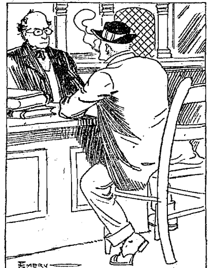
"He is Deaf in the Sympathetic Ear."

of veterans who have been on the diamond for 15 years. I made good at the start, drove out a homer or two and cleaned the bases when runs counted, and I had a letter from the old gentleman offering me a place as playing manager of the Andover concern if I held up my average.