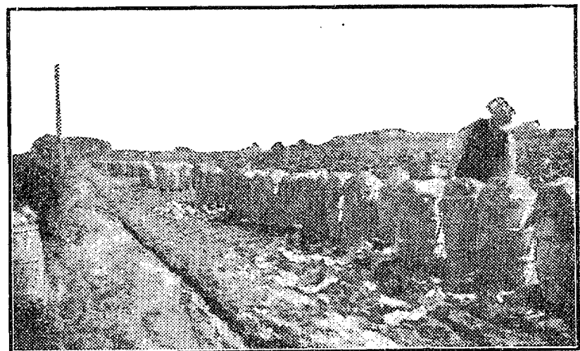
One Day's Harvest.

Besides the Staple Market-Garden Crops Grown, There Are Many Others Which Are Peculiar to Certain Localities and Climate.