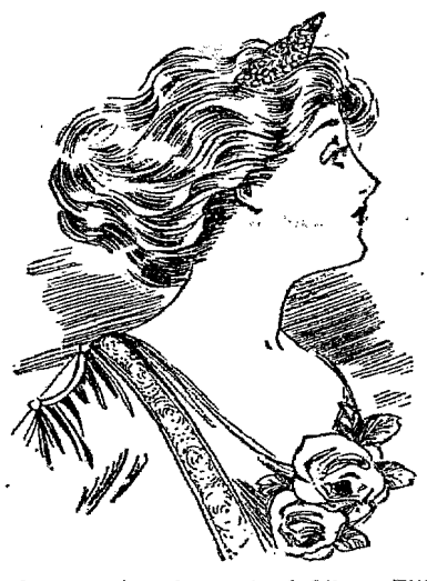
A Becoming Coronet of Silver Filigree and Seed Pearls.

Dainty gloves for summer evening wear are of delicately tinted silk, embroidered in jewels.