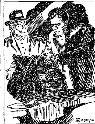
"Where's the Bomb?"

"Trying to stink out my business, you scum, are you?" roared Schmitz. "Burning your punk balls under my