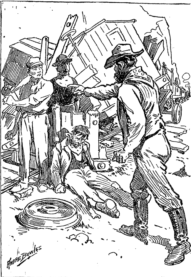
"Water!" Bawled Sinclair, "Have My Men Got Nothing to Do But Carry Tramps to Water?"

"That's a little stuff mashed up in the merchandise car; there's some tobacco there and a little wine, I guess. The cases are all smashed."