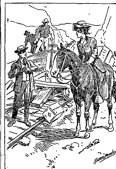
She Was Something Like an Apparition.

To McCloud she was something like an apparition. He sat spellbound until the trackman indiscreetly pointed him out, and the eyes of the visitor, turning his way, caught him with his hands on the rock in an attitude openly curious. She turned immediately away, but McCloud rose and started