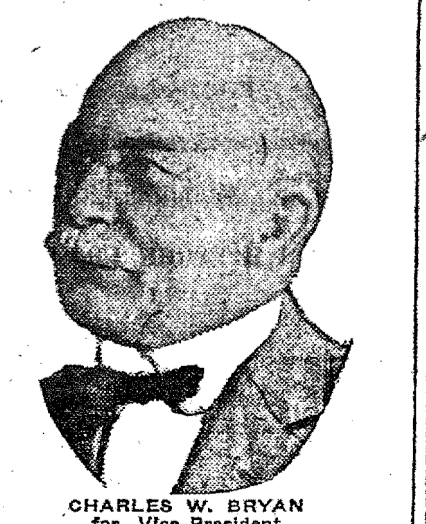
CHARLES W. BRYAN for Vice-President