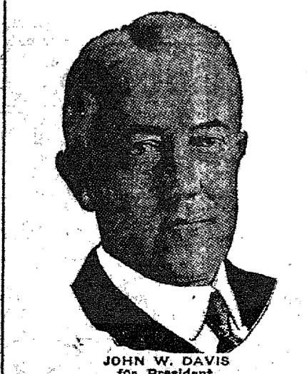
JOHN W. DAVIS for President

Pocahontas. The real name of Pocahontas was Matoaka. Pocahontas is a verbal adjective, meaning he or she is playful. This nickname was used by Pocahontas' father, Powhatan, in speaking with the Virginia colonists.