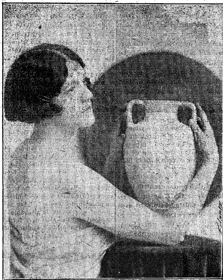
NO, THIS ISN'T REBEKKA AT THE WELL

The picture will be the feature at the Strand Theatre for seven days beginning next Sunday.